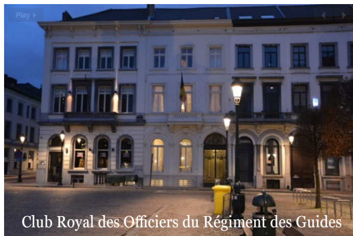
Club Royal des Officiers du Régiment des Guides