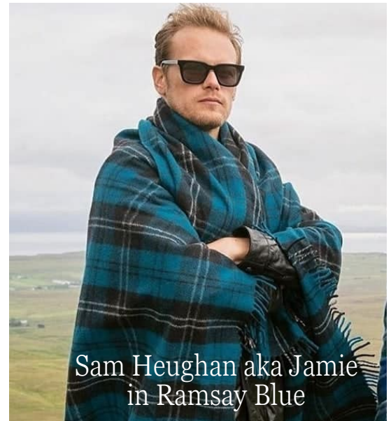
Sam Heughan aka Jamie in Ramsay Blue