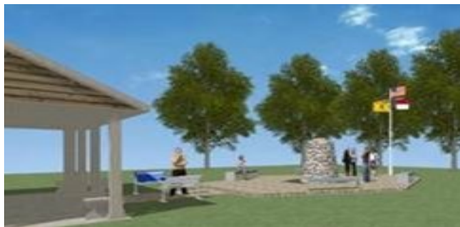
Cape Fear Scottish Immigration Memorial

Construction of the cairn and surrounds has begun and several sites along the trek have been established and plaques established along the route.